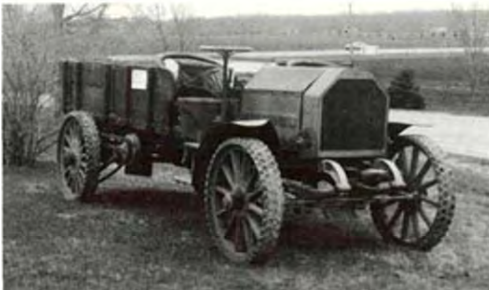
This 1910 Avery truck is all original. This combination truck-tractor had a pulley on front of engine to run belt for a threshing machine. Built mostly for agricultural use.